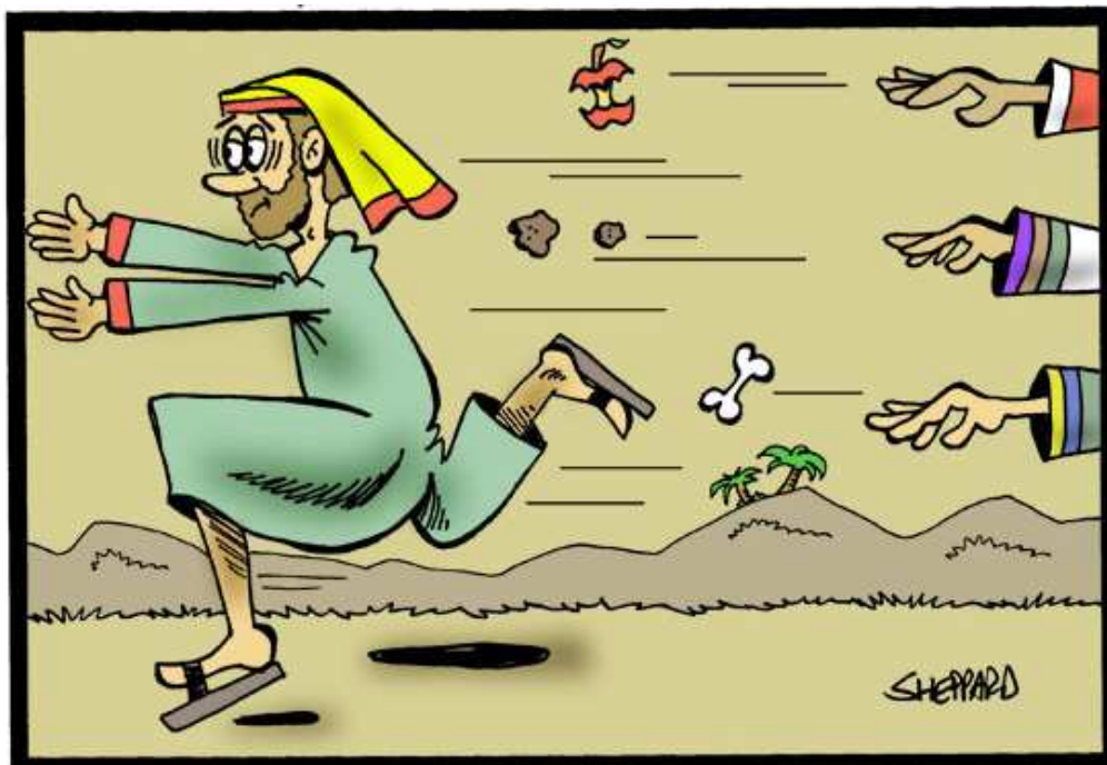
The reaction to Pharaoh's new health care plan was truly unexpected